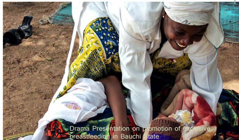
Drama Presentation on promotion of exclusive breastfeeding in Bauchi state

Kogi State Flood Response: In September 2012, following devastating flooding from the Benue and Niger Rivers which affected communities