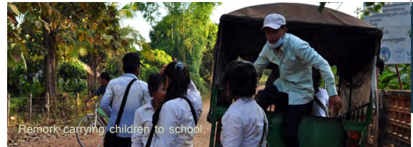
Remork carrying children to school.

PFD continues to implement its innovative Providing Rural Communities Equal Care Through Transport (PROTECT) project—which provides a transportation system in rural Kratie province to bring pregnant women to antenatal care and delivery at the health center, while at the same time allowing access to travel for the entire village. The system has had unexpected positive results; allowing school children to get to schools safely and consistently.